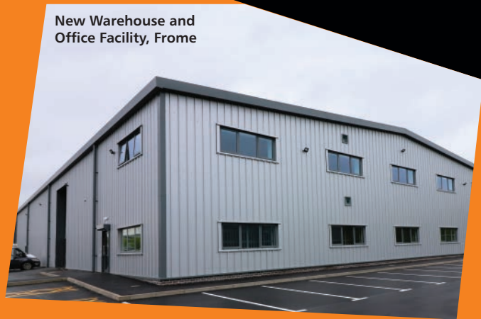
New Warehouse and Office Facility, Frome

MELHUISH & SAUNDERS LTD 8/9 LANDMARK HOUSE WIRRAL PARK ROAD GLASTONBURY SOMERSET BA6 9FR T: 01458 831349 F: 01458 898252 E: office@mandsltd.co.uk