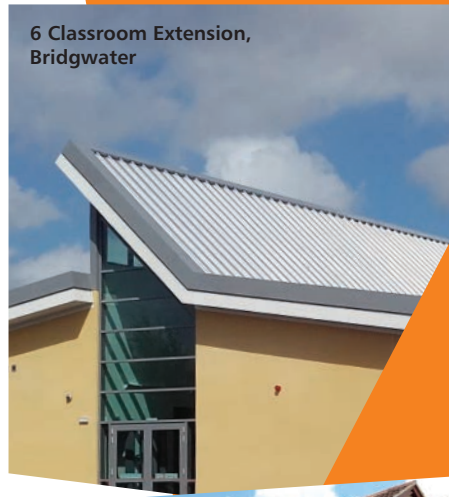
6 Classroom Extension, Bridgwater

Public Sector: libraries, country park facilities, supported living centres