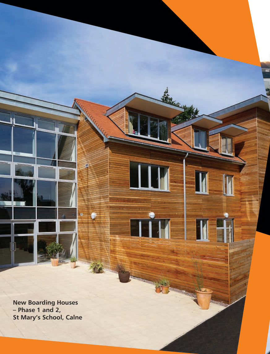
New Boarding Houses – Phase 1 and 2, St Mary's School, Calne