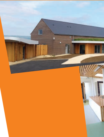
Guest House, Spa and Conference Facility, Frome

The Company has a unique team of highly skilled professionals and tradesmen who have a diverse knowledge of construction. Through continued investment in training, we ensure that all of our workforce operates to the highest standard.