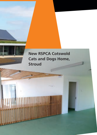
New RSPCA Cotswold Cats and Dogs Home, Stroud