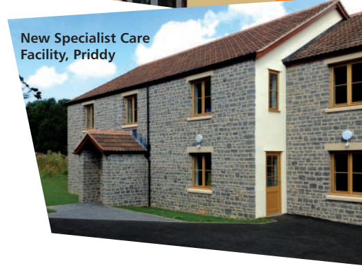
New Specialist Care Facility, Priddy